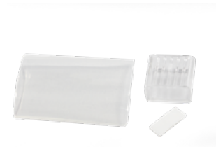
End Cap Kit Part Number: BRI-SL-A-EC 1 - End cap 1 - Light shield 1 - Heat-shrink tube