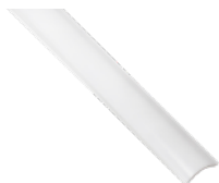
Diffuser Part Number: BRI-SL-A-CD 1M (3.2') section