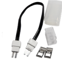
Jumper Connector Kit Part Number: BRI-SL-A-JC 1 - Jumper connector (10") 2 - Clear plastic retainers 2 - Metal anti-slip plates 2 - Heat-shrink tubes