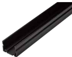
Strip Light Channel w/ Groove Part Number: BRI-SL-A-C 1M (3.2') Channel sections 5 - Screws