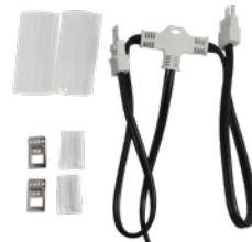
T Power Feed Connector Kit Part Number: BRI-SL-A-T 1 - "T"power feed connector (3.2') 2 - Clear plastic retainers 2 - Metal anti-slip plates 2 - Heat-shrink tubes