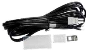
Power Feed Kit Part Number: BRI-SL-A-PF 1 - Power feed (10') 1 - Clear plastic retainer 1 - Metal anti-slip plate 1 - Heat-shrink tube