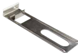
Attachment Clip Part Number: BRI-SL-A-AC