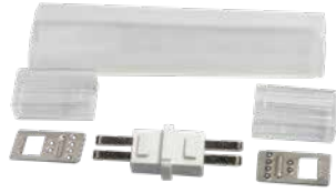
Double-Sided Connector Kit Part Number: BRI-SL-A-DSC 1 - Double-sided connector 2 - Clear plastic retainers 2 - Metal anti-slip plates 1 - Heat shrink tube