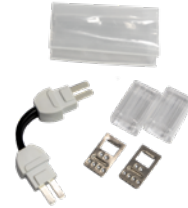
90° Jumper Connector Kit Part Number: BRI-SL-A-90 1 - Jumper connector (1") 2 - Clear plastic retainers 2 - Metal anti-slip plates 2 - Heat-shrink tubes