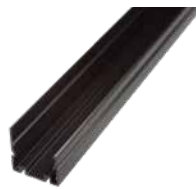
Strip Light Channel w/ Groove & Glare Shield Part Number: BRI-SL-A-C2 1M (3.2') Channel sections 5 - Screws