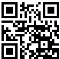
Brilliance Smart app

TECHNICAL REQUIREMENTS: Must have consistent 2.4 GHz Wi-Fi signal at the installation location with dBm strength of -70 or better. See the Brilliance Smart Products Guide for more information and troubleshooting. Must be placed in landscape lighting transformer or in a covered receptacle box.