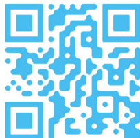
Smart Socket 2.0 Set Up